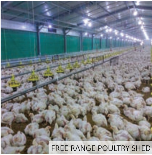
FREE RANGE POULTRY SHED