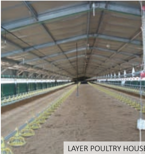
LAYER POULTRY HOUSE