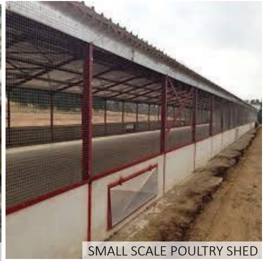
SMALL SCALE POULTRY SHED