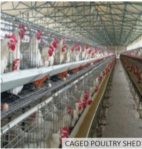
CAGED POULTRY SHED