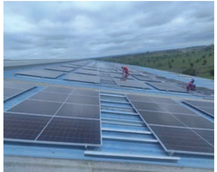
Project : Roof mount System - Isinya Plant along Nairobi - Namanga Road, System Size: 250 KWp Completed: 2023