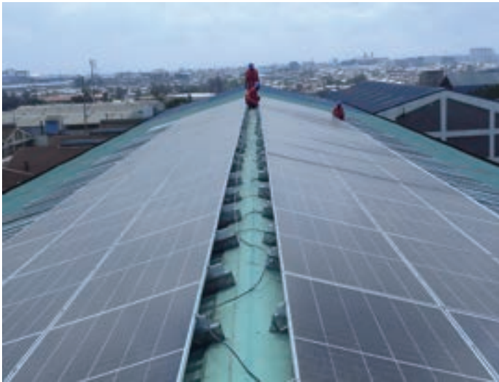
Project : Roof mount System - Enterprise Road, System Size: 50 KWp Completed: 2023